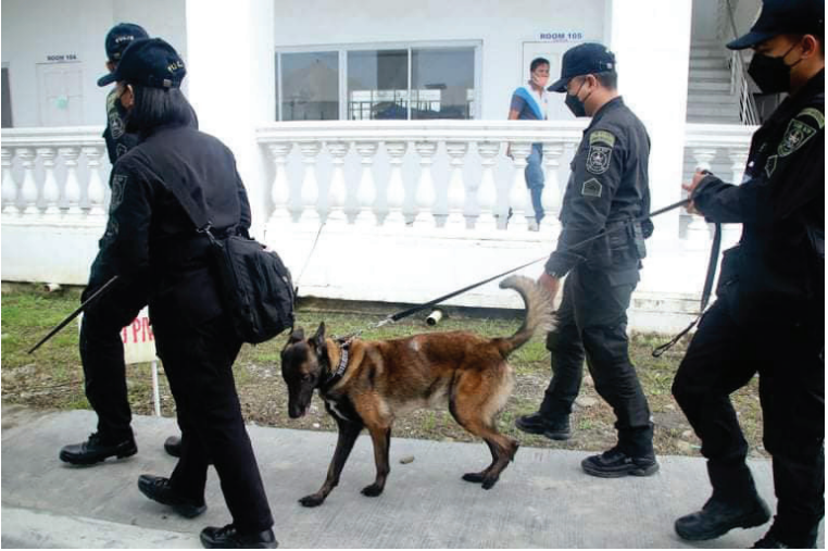
Venue security and security checks for the Bar Exams