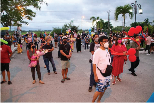
Bar examinees' and their families after the exams