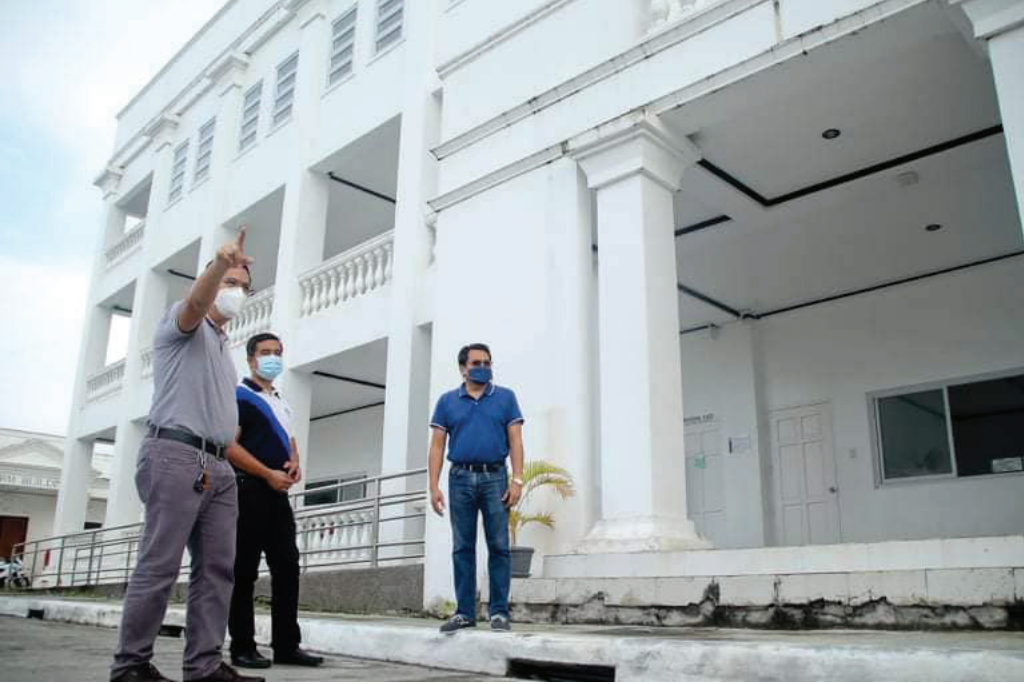
Venue preparations and checking for the Bar Exams