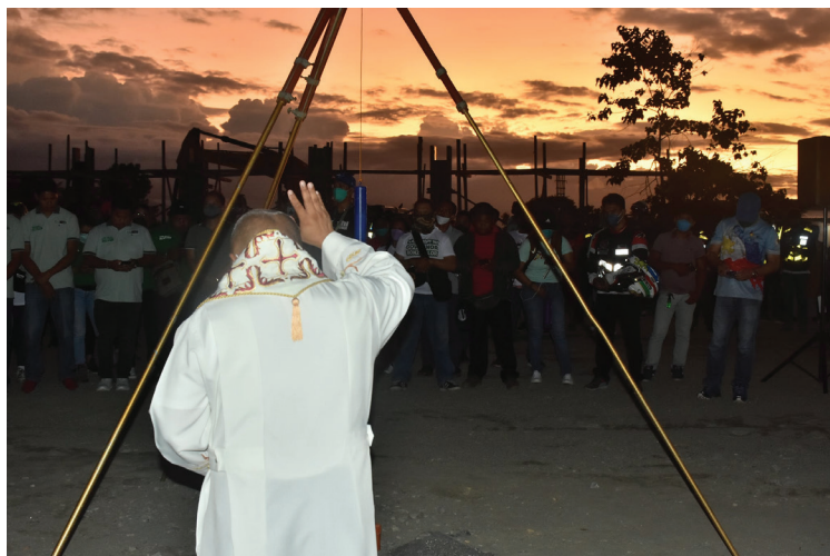
Blessing sa Inauguration ng IT Park

LIBONG BILANG NG MGA KABATAAN ang mabibigyan ng trabaho oras na maipatayo ang proyektong Oriental Mindoro Information Technology Park. Nagkaroon ng malaking pag-asa ang mga kabataang Mindoreno na dito na sa lalawigan ng Oriental Mindoro magtrabaho sa halip na sa labas pa ng lalawigan matapos isagawa ang groundbreaking ceremony ng sisimulang Oriental Mindoro IT Park sa Barangay Sta. Isabel, Calapan City, noong Abril 24.