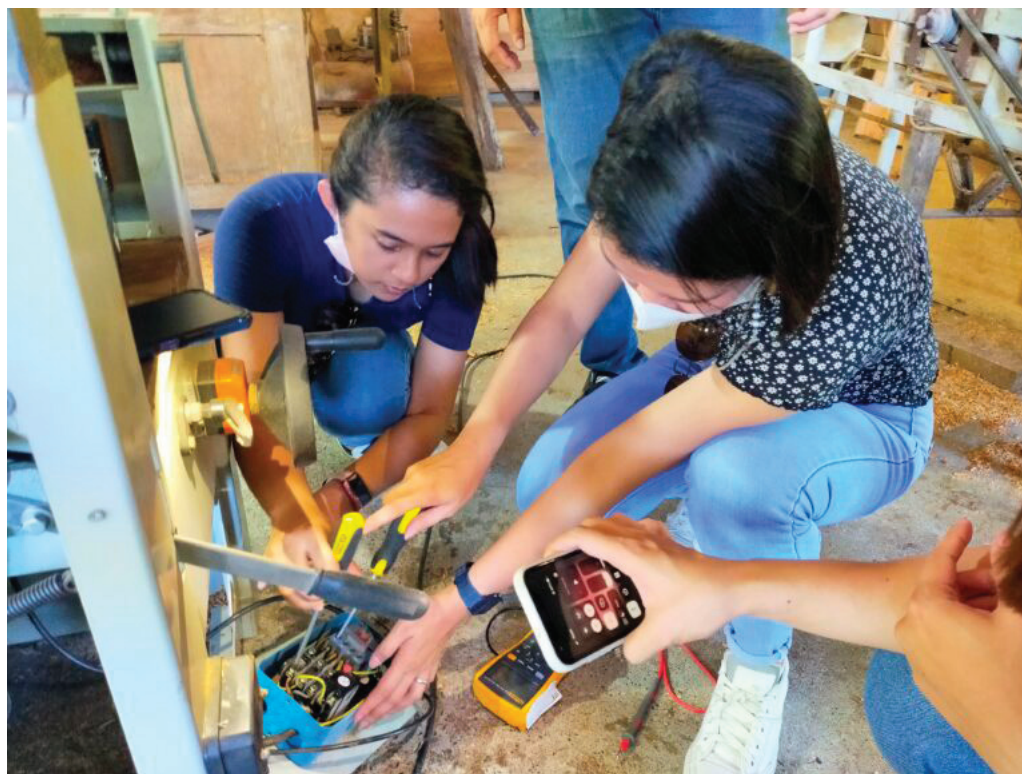
The AMERIAL Team while troubleshooting the multiple-use wood working machine of JM @ JM Furniture

After the visit, the AMERIAL Team is expected to prepare assessment reports and proposals for all identified potential automation interventions and to be virtually presented to the selected MSMEs for review and approval.