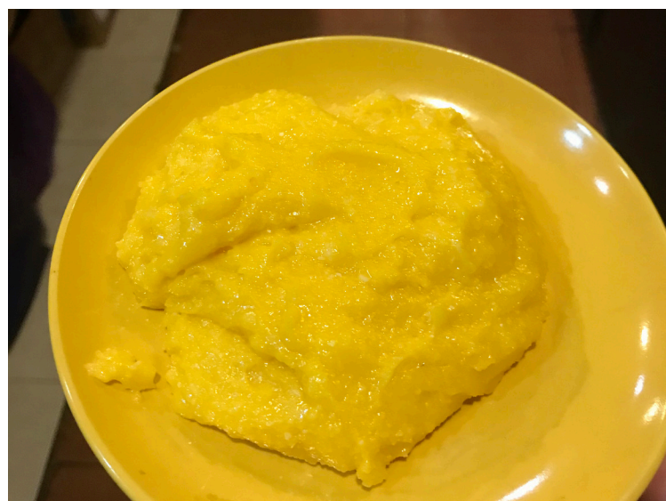
This is the paste for our carbonara, it is made from egg yolks and parmigiano reggiano cheese, no cream!

If you are making fresh pasta you can make your cream during the end of the resting period of your pasta dough.