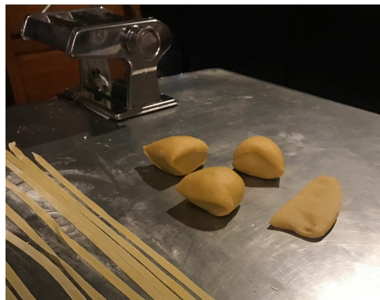
Making fresh pasta for this authentic carbonara meal