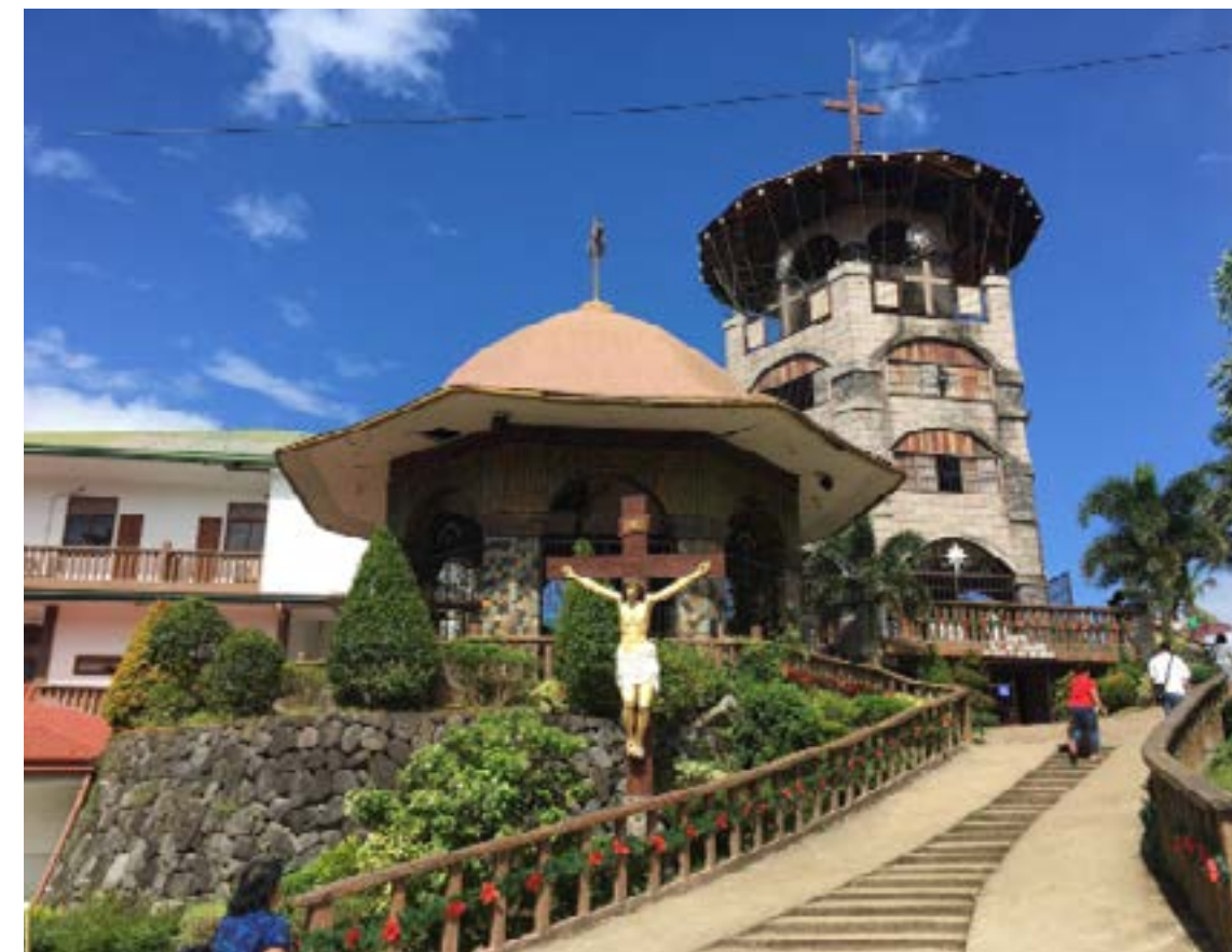
THE NATIONAL SHRINE OF SAINT PADRE PIO. Located at Brgy. San Pedro, Sto Tomas, Batangas and a 10 minute ride from LAUREL HERITAGE RESORT AND SPA. We are located at Poblacion 4, Sto. Tomas, Batangas. We do have room accommodations and restaurant among others, that you and your family can go or stay at, before or after your Shrine’s visit